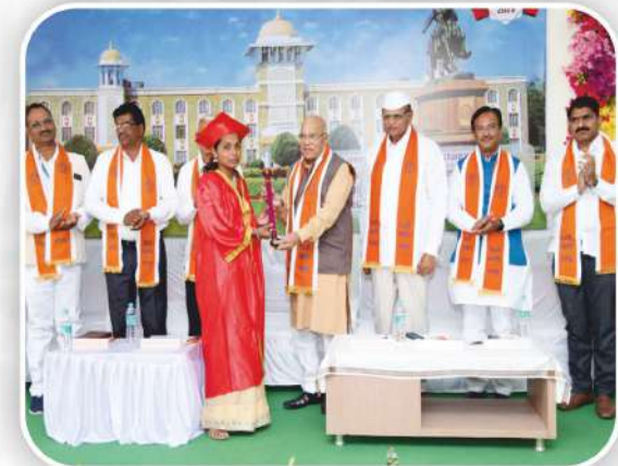
2 nd Graduation Day Ceremony