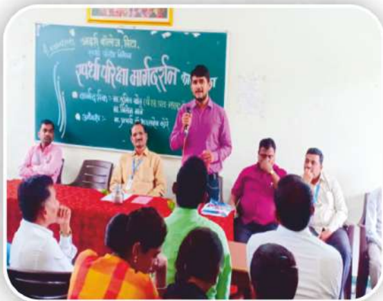
Competitive Exam Guidance