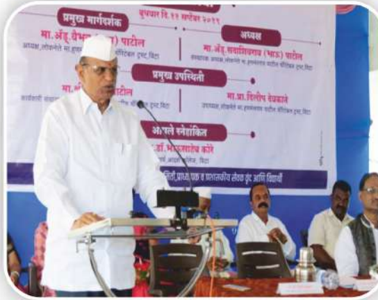
Speech by Hon. Adv. Sadashivrao (Bhau) Patil on occasion of Parents Meet