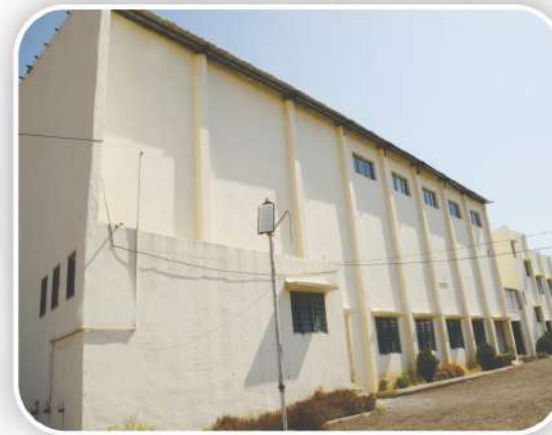
Indoor Sport Complex