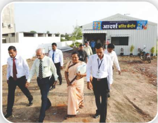
Adarsh College Canteen