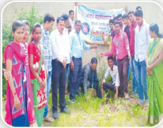
Tree Plantation Campaign