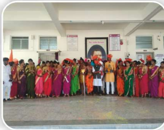
Traditional Day Celebration