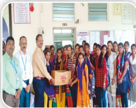
Help provided to Flood affected people