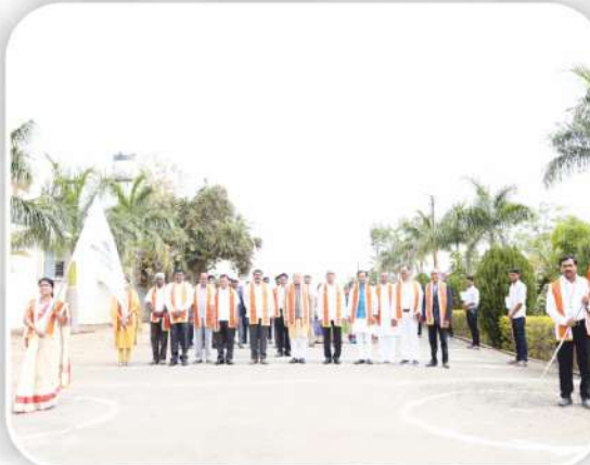
2 nd Graduation Day Ceremony