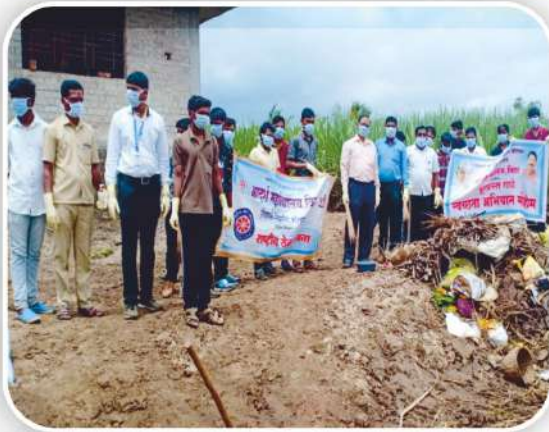
Cleanliness Campaign at Flood Affected Village Nagrale