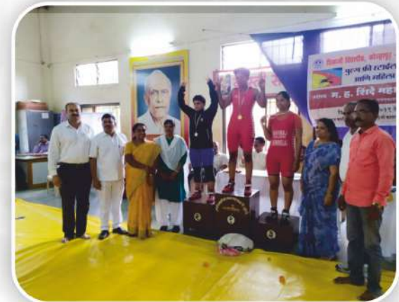
Judo (Female) Winner Team M.H. Shinde College, Tisangi.