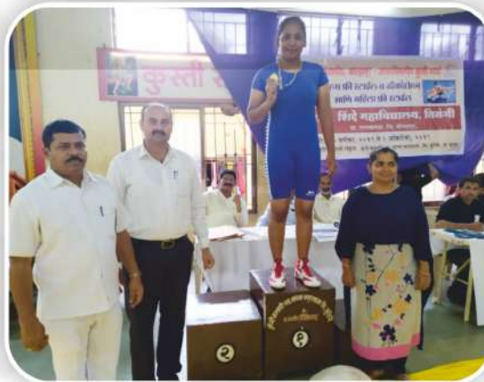
Judo (Female) Winner M.H. Shinde College, Tisangi.