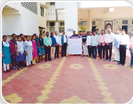
Corona Awareness Campaign