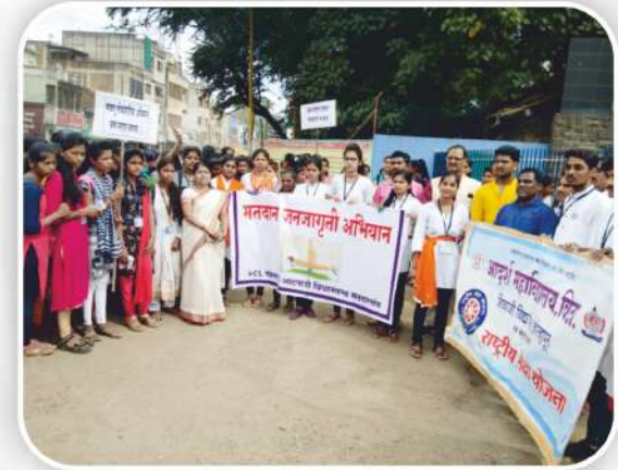
Voting Awareness Campaign