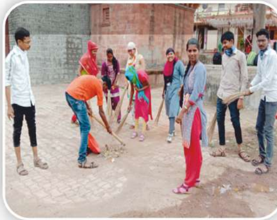
Cleanliness Campaign at Ghoti (Kh.)